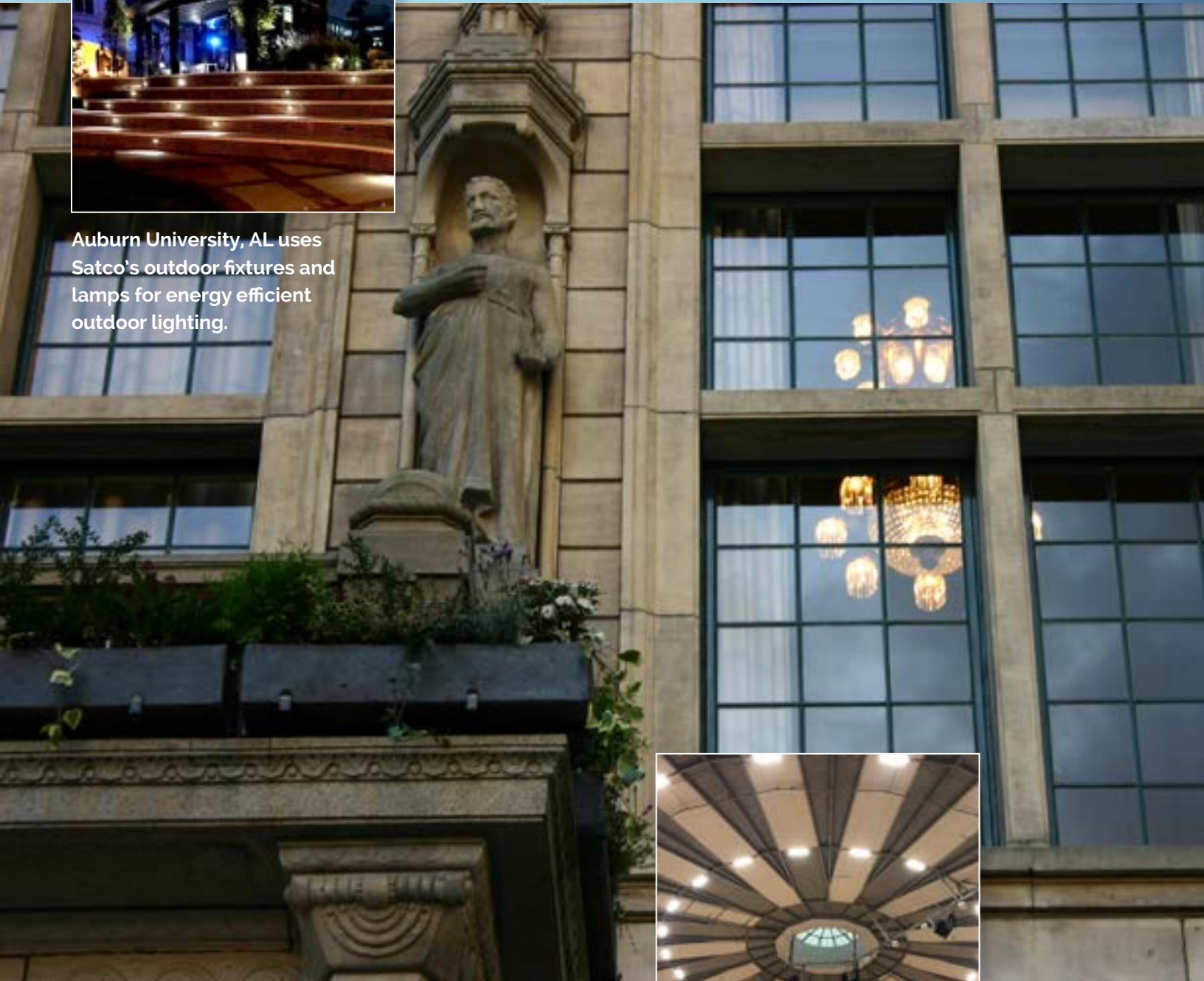
Decorative LED lamp retrofits in New York's City Hall's chandeliers offer code compliant energy efficient lighting in traditional fixtures.