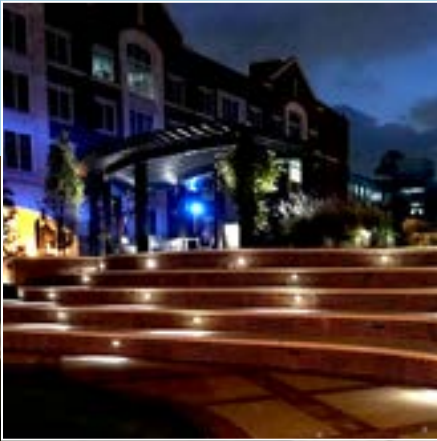
Auburn University, AL uses Satco's outdoor fixtures and lamps for energy efficient outdoor lighting.